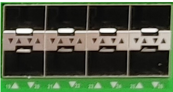
10G or 25G