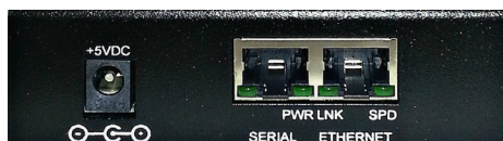
Back view of portable TAP with serial and ethernet remote management.

Dimensions (HxWxD): 1.15" x 3.9" x 6.5" (29.21mm x 99.06mm x 165.10mm) Weight: 0.7lbs (0.317kg)