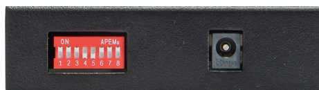
Back view of portable TAP with manual management.